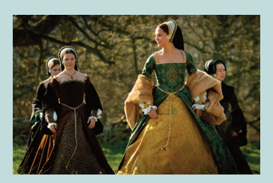
FIREBRAND (15) SEE PAGE 6