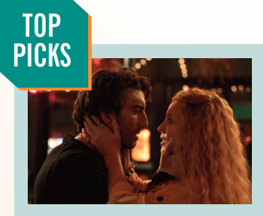
IT ENDS WITH US (15)